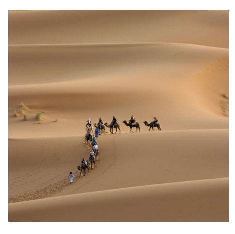
Camel caravans carried goods across the Sahara to and from medieval Ghana.

The kingdom of Ghana lasted from sometime before 500 C.E. until its final collapse in the 1200s. It arose in the semidesert Sahel and eventually spread over the valley between the Senegal and Niger rivers. To the south was forest. To the north lay the Sahara. Today, this region is part of modern nations Mali and Mauritania (maw-reh-TAIN-ee-uh). The modern country of Ghana takes its name from the old kingdom, but it is located far to the south.