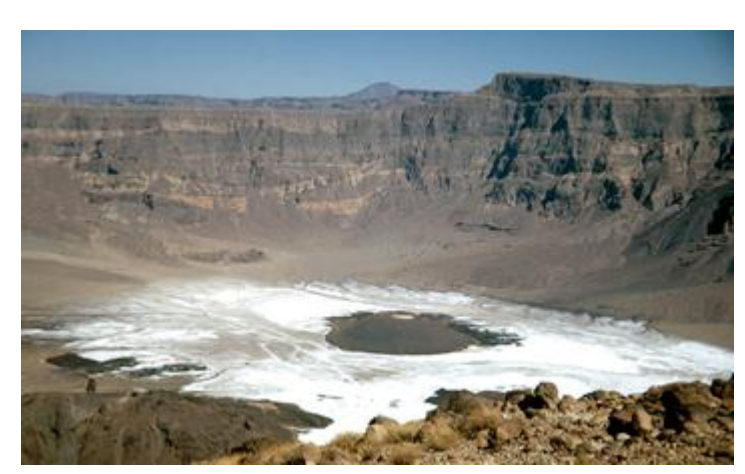
In some parts of Africa, salt is made by the evaporation of water in areas called salt flats, such as this one. The salt is then dug out in large blocks.

Salt was produced in two ways in the Sahara. One method was through evaporation . Water was poured into holes in the salty earth. The water slowly drew out the salt and then evaporated in the sun. The salt that remained was scooped out and packed into blocks. The second way to get salt was through mining. At Taghaza, salt deposits were found about three feet below the surface of the earth. Miners, enslaved by Arab merchants, reached the salt by digging trenches and tunnels. Then they cut it out in large blocks.