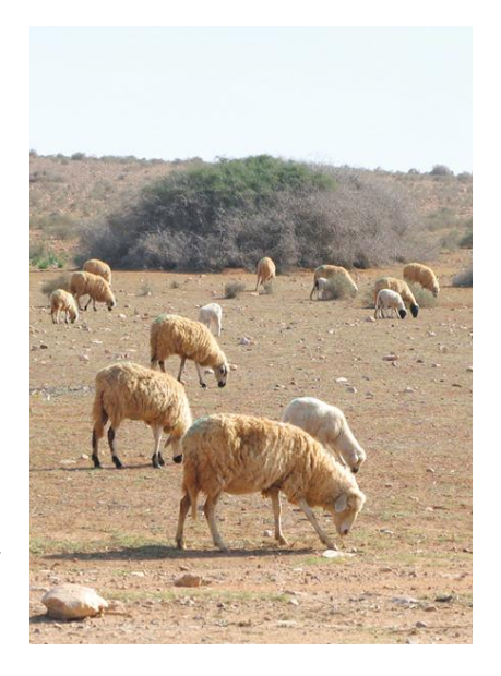
Natural resources, such as water and tress, are still scarce in areas like the Sahel.

Like Ghana, Mali gained much of its wealth from the control of trade, particularly in gold. Its leaders had accepted Islam, and under their rule, the Muslim faith went on to become even more influential in West Africa.