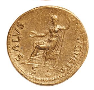
The Romans and people in Muslim lands used West African gold to make their coins.