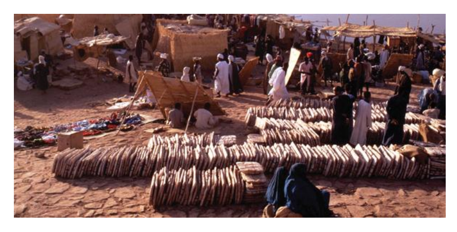
Even Today, salt is an important trade item in West Africa.

Kumbi had the busiest market in West Africa. Many local crafts-people sold their goods there. Ironsmiths sold weapons and tools. Goldsmiths and coppersmiths sold jewelry. Weavers sold cloth, and leatherworkers sold leather goods. There