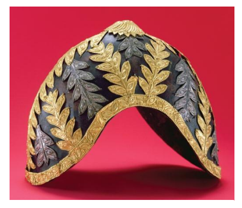
Ghana's kings wore caps like this one, decorated with gold.

Ghana's king acquired great wealth through control of the gold trade. Gold was especially plentiful in areas to the south of Ghana. As you will see, Ghana's government collected taxes on the gold that passed through the kingdom.