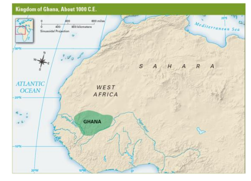
Its location at the crossroads of major trade routes south of the Sahara and along the rivers brought medieval Ghana great wealth and power.

Ghana's Military Ghana's military included a regular army, reserve forces, and elite soldiers. The regular army was made up of several thousand career soldiers. They kept the borders secure, put down minor revolts, and maintained peace and order. These soldiers wore knee-length cotton pants, sleeveless tunics (long shirts), sandals, and headdresses adorned with feathers. The color of a soldier's tunic and the number of feathers in his headdress indicated his rank. The soldiers used weapons such as spears, daggers, swords, battle clubs, and bows and arrows. They were well paid and highly respected.